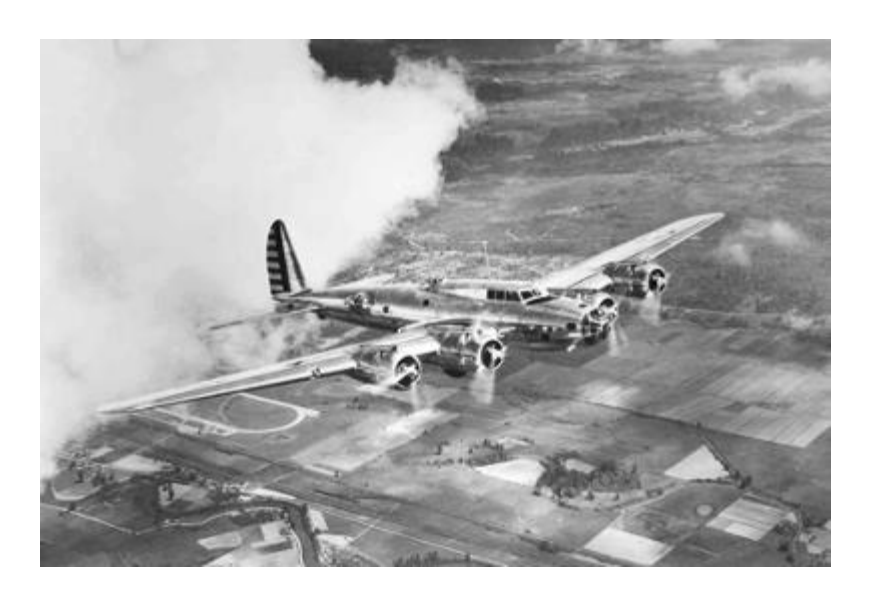
Image: B 17 (Liberator) World War II bomber in Flight

This special program features commentary by Bob Dyer describing the history of events on a little-known historical occurrence in the annals of Swedish and American history: Sweden's role in hosting thousands of U.S. airmen during World War II. When the aviators had to make forced landings of their "flying fortress" aircraft after bombing runs in Germany, many American airmen ended up interned in Sweden, where they recuperated from injuries; some spent many months in Sweden.