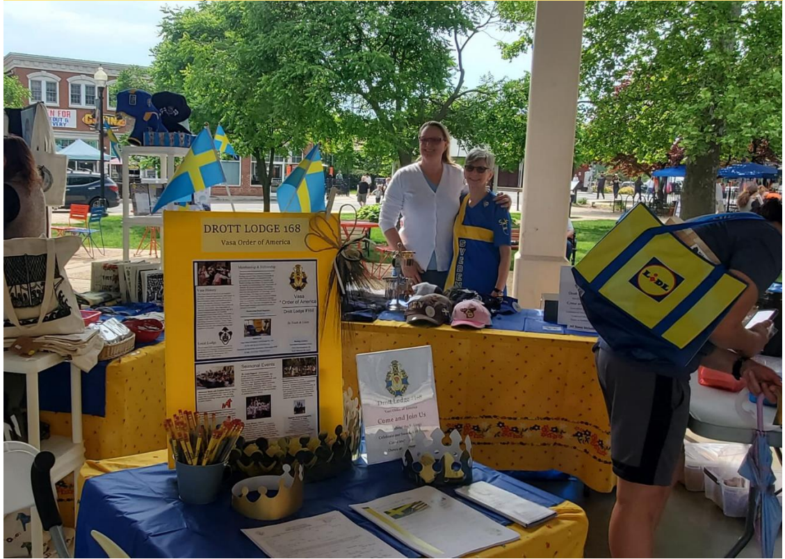
Drott Lodge set up under the pavilion

Drott also sold Imported Gifts and had an information table. Thank you to all who came out to help at this event!