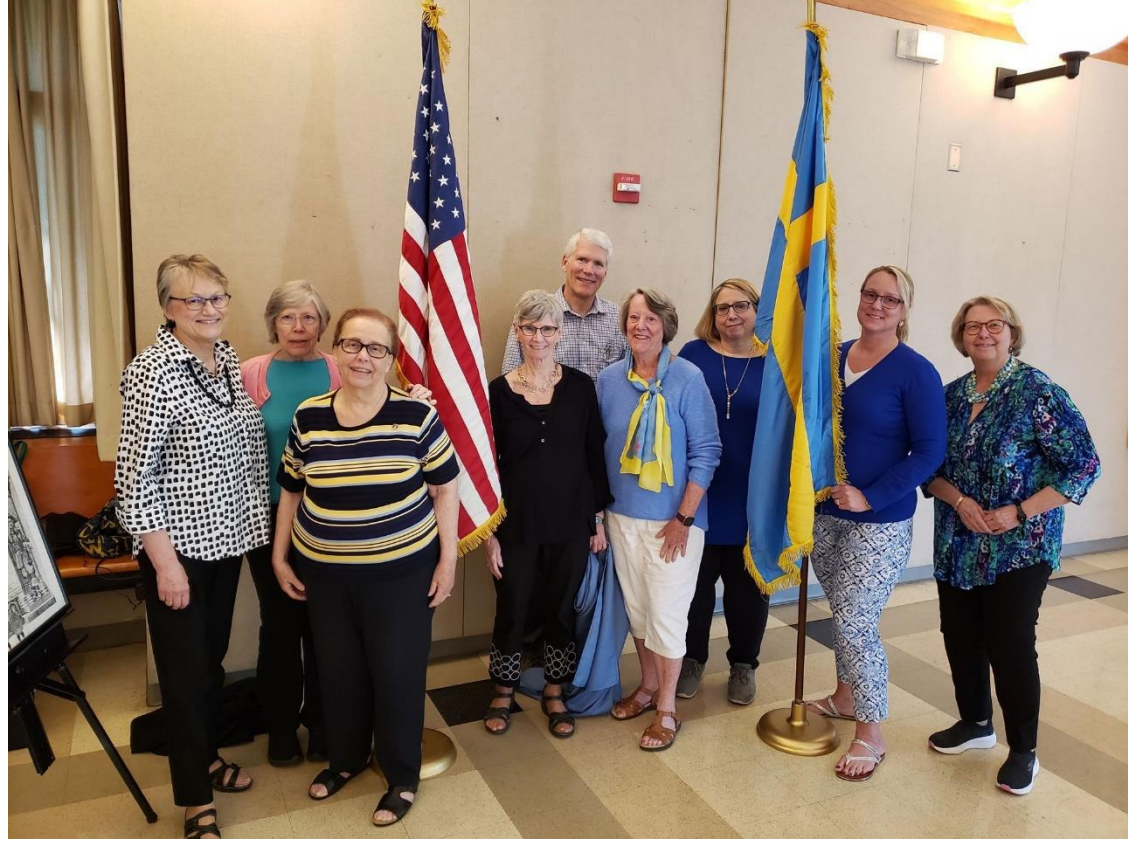
Drott members and officers