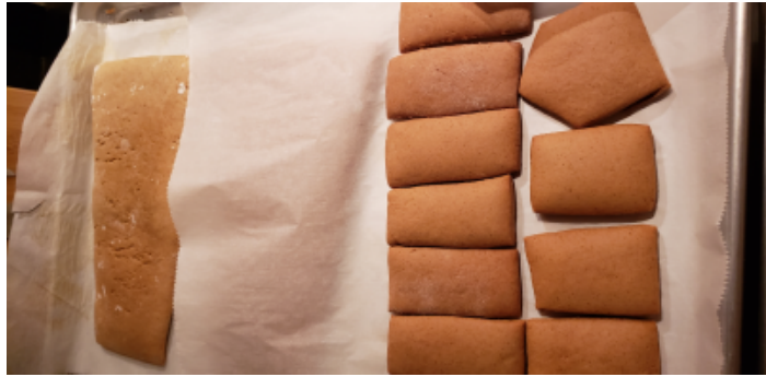
Some of the baked pieces.

rolled out the ginger bread dough, cut out all the pieces and baked them. I made several walls, two roofs, an island as a base, and some rocks. I let the pieces cool until the next day.