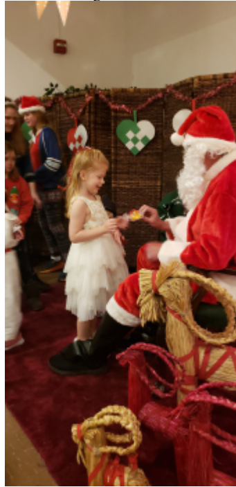
Visit with Santa