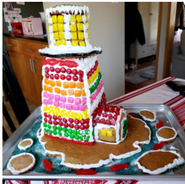
Finished project complete with Swedish sharks surrounding the light house island.