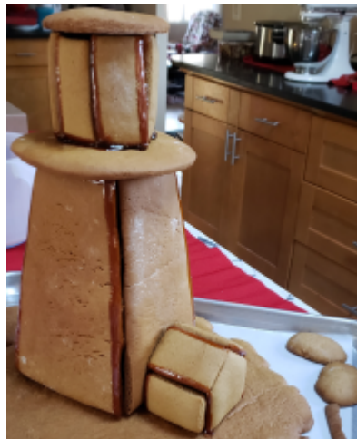
Glued all the pieces together with sugar.

Day three was the fun day. I glued the pieces together with sugar that I had heated up until it got liquid (very hot). It works very fast, you only get one chance to glue one piece to another. I had to shave off some of the corners before glued to make sure they would line up.