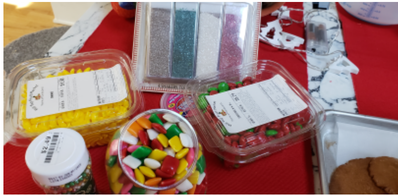
Lots of candy.

I like to make my projects colorful and fun, rather than perfect and realistic in size and scale. Also, having worked with two young boys in the past, I do not get upset if the pieces aren't glued together perfectly, or the candy looks a little crooked. It's still a lot of fun to be able to make this in 6 hours time and then just enjoy looking it!