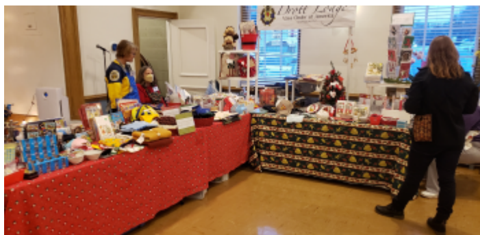
Drott Lodge Mini Jul Bazaar