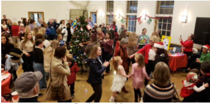
Dancing around the tree