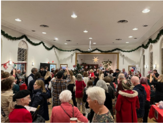
View of the parish hall