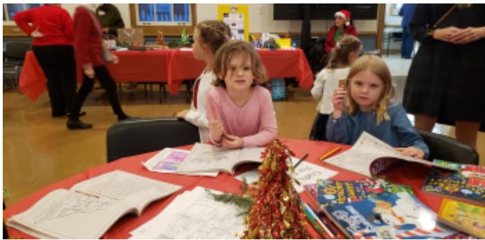
Kids' craft table was a hit