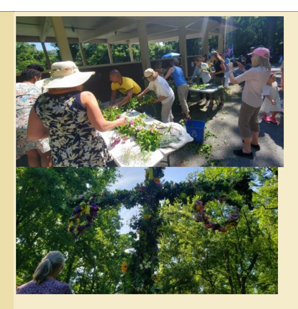
Traditional dance around the May pole