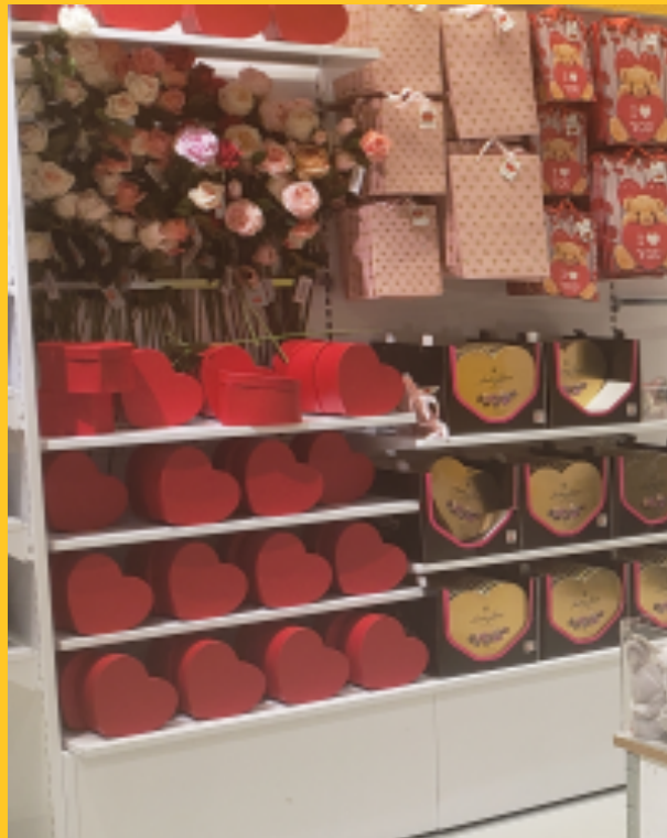
Giftbags, silk roses, heart shaped boxes.