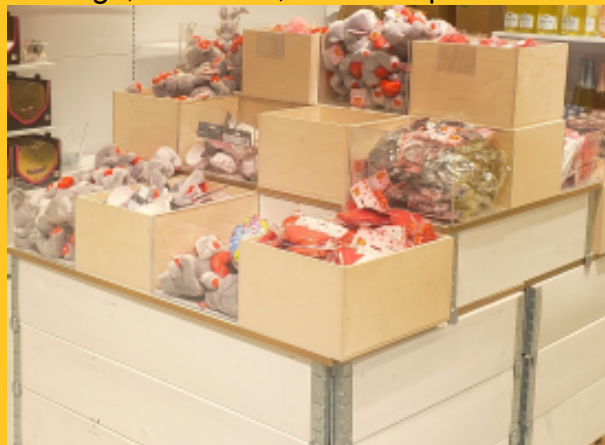
Stuffed bears, keyrings, cookie cutters.