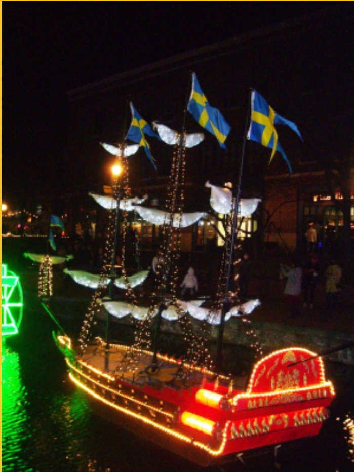
Vasa ship in Frederick MD