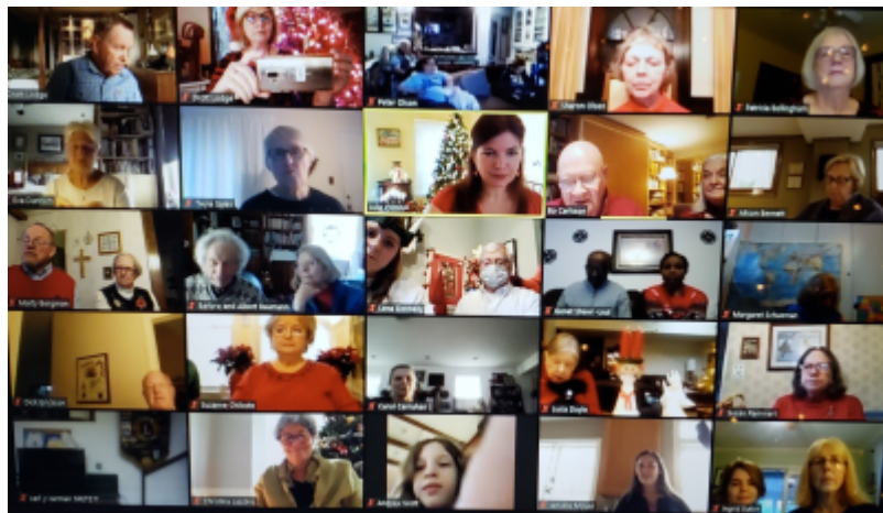
Some of the participants from District 9 Pennsylvania