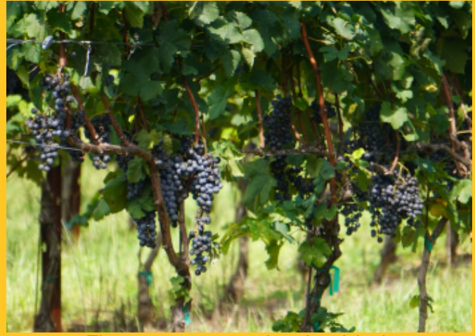
The grapes were ready to be picked.