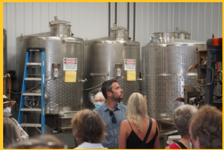
Finding out how they make the wine. This is where it happens.