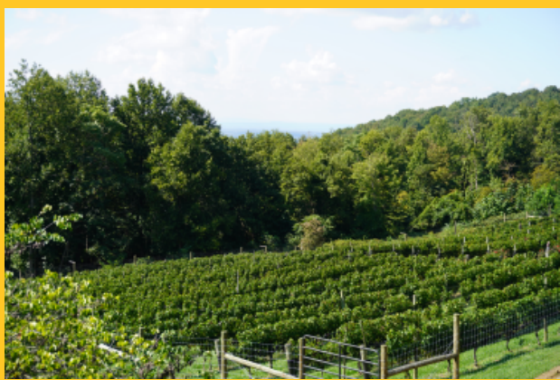
View of the winery and VA mountains in the background.