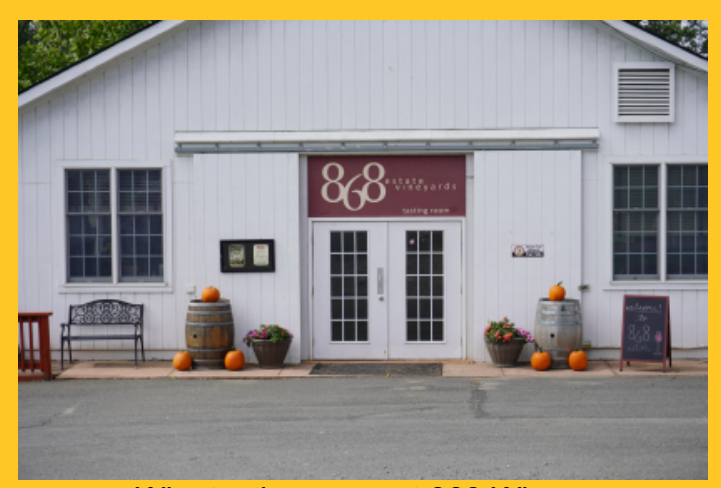
Winetasting room at 868 Winery