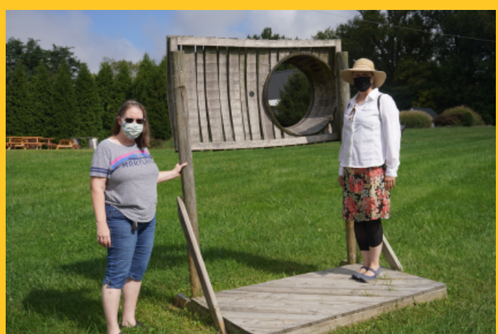
Waiting for the tour to start.