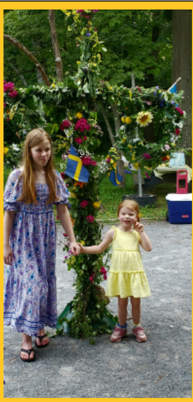
An ASA daughter and a Drott daughter enjoying the day together.