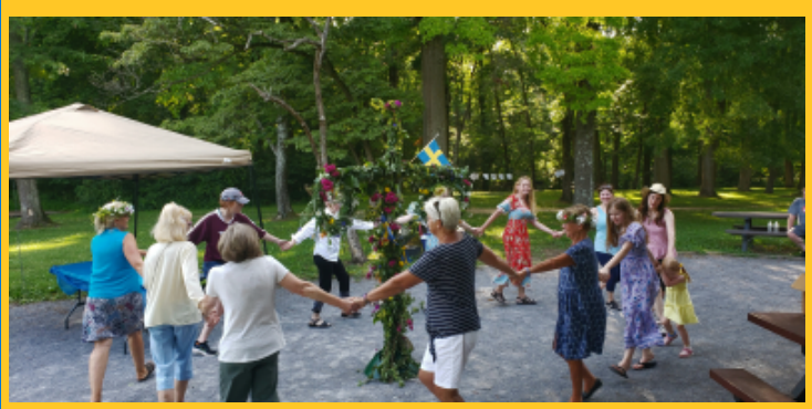
More dancing around the Maypole.