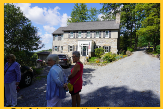
Twin Oaks Winery - waiting for the tour to start