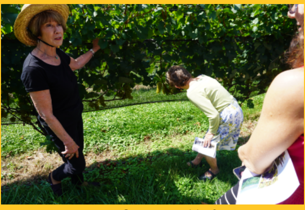
Our tour guide & owner was very knowledgeable.