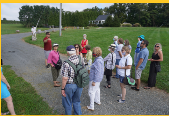
Listening to our guide.