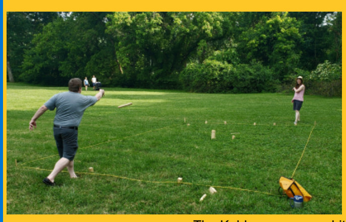
The Kubb game was a hit.