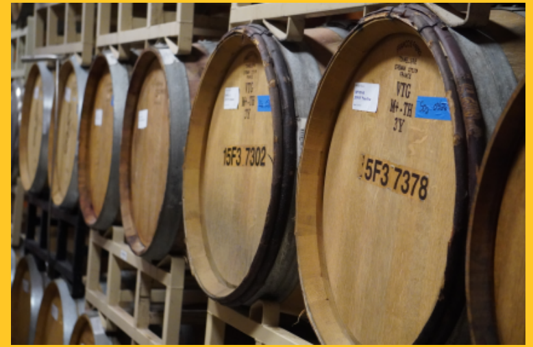
Lots of wine stored in here.