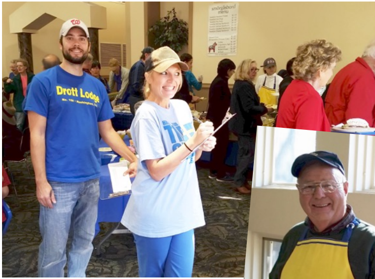
Drink servers and order totalers were only a few of the many workers needed for the popular food line.