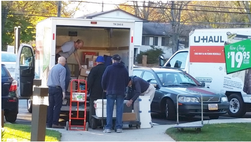
It took 2 U-Hauls and many strong arms to get all the Drott equipment from the storage unit into the Hall.