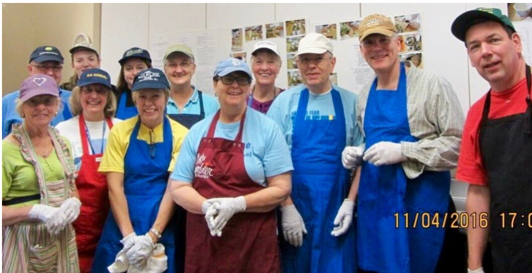
The hard-working kitchen staff who prepared food for the Smörgåsbord started Friday evening and came in at 7 am on Saturday!