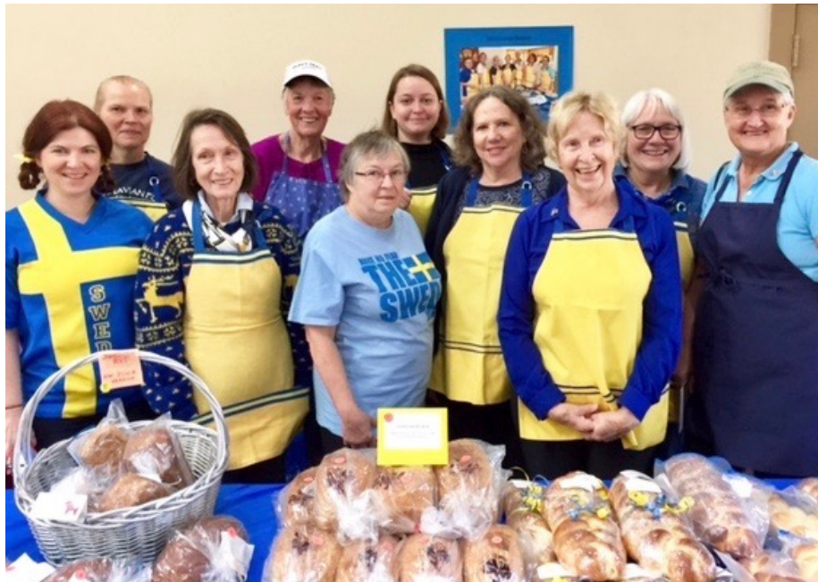
Drott's many bakers produced breads and desserts in their homes. There was even a group baking session in the weeks before.