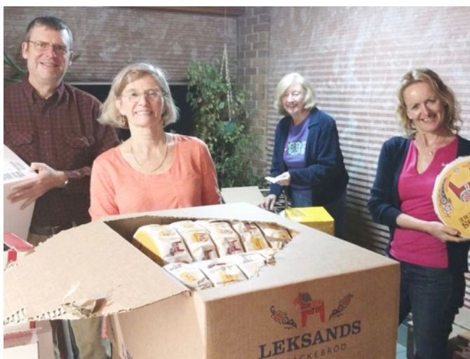
An Imported Foods labeling party gave each item its price sticker many days before the Bazaar took place.